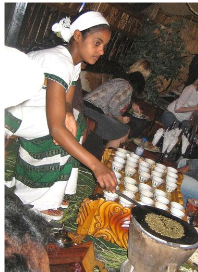
Ethiopian Coffee Ceremony: Green coffee beans are pan-roasted, ground in a pestle and mortar, and coffee made in a spherical-shaped pot called a jebena . The coffee is then served in traditional tasting cups.

The birthplace of coffee, the Kaffa Region in Ethiopia – which gave its name to coffee - grows only arabica beans. Coffee remains central to Ethiopian culture and heritage and is shared with family and friends through coffee ceremonies.