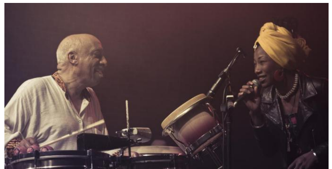
Mulatu Astatke on stage with Malian singer Fatoumata Diawara.

The eight-night FAM trip will take place in March 2014 visiting Addis Ababa, Lalibela, Gondar, Axum and the Bale Mountains National Park.