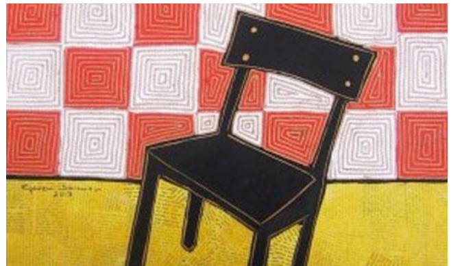
Exist Yellow Chair, 2013.