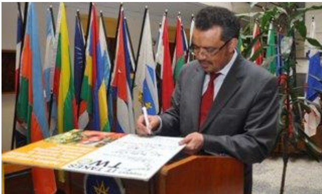
Ethiopia's Foreign Minister, Dr Tedros Adhanom, signed a petition on 14 th November which supports family planning as a way of building a mass constituency of support for the equality of girls and women around the world.

The use of family planning is now regarded as one of the more crucial elements of human rights embedded in Ethiopia's constitution and other government policies. The PM said the Government was committed to providing family planning services to at least 11 million women by 2020, and said the Government would be allocating more resources to further expand family planning services through a major "government-led" and "country-wide" Health Extension Programme. This has already trained and deployed over 38,000 health extension workers in communities across the country; two for every village. Ethiopia is also promoting women's participation through the Women-Centred Health Development Army to achieve the Millennium Development Goals on reproductive health and family planning services, the PM added.