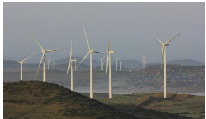
Ashegoda Wind Farm

Ethiopia witnessed a landmark in the development of renewable energy in Africa with the official opening of the Ashegoda Wind Farm, the largest in sub-Saharan Africa, with a capacity of 120MW – enough to supply energy to over 100,000 homes.