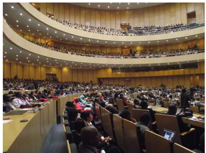
Speaking at the opening ceremony, PM Hailemariam Desalegn recognized the work of the

Access, Full Choice. It brought together more than 3,000 advocates, researchers, health professionals and political leaders from over 100 countries. The conference's main focus was on the benefits of giving access to contraceptives to the people of the world, allowing them to live their lives in accordance with socio-economic development and their environment, to reduce morbidity and mortality.