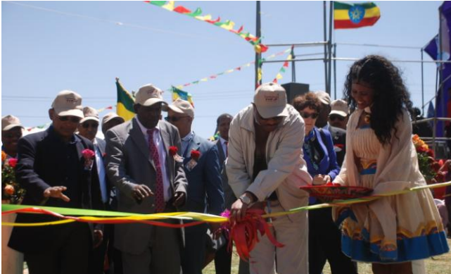
H.E. Hailemariam Desalegn at the grand opening of the wind farm

The PM took the opportunity to pay homage to his predecessor, the late PM Meles Zenawi, whom he referred to as "Africa's green growth champion".