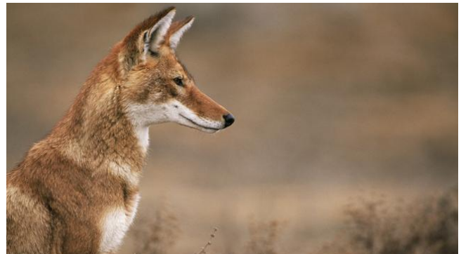
Bale Mountains National Park is home to over half of the global population of Ethiopian wolf, the rarest canid in the world - there are just 400 remaining.

The park is known for being home to the largest populations of both endemic and endangered mammals, including five that are only found in the Bale Mountains, these include the Ethiopian wolf, Mountain Nyala and Bale monkey.