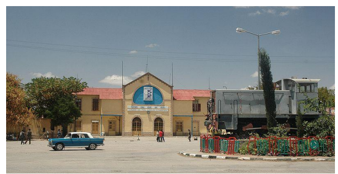
Station of the Djibouti-Ethiopia Railway in Dire Dawa

Growth and Transformation Plan; Ethiopia will construct more than 3,000km of railway lines across the country, connecting 50 urban towns and all neighbouring countries.