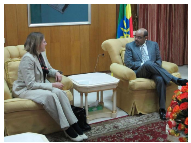
Finnish Minister for International Development, Heidi Hautala and Prime Minister Meles Zenawi

During her four-day visit, Minister Hautala met Prime Minister Meles Zenawi, Deputy PM and Foreign Affairs Minister Hailemariam Desalegn, and Minister of Finance, Sufian Ahmed.