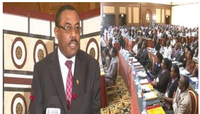
Deputy Prime Minister and Foreign Affairs Minister, Hailemariam Desalegn said the government is taking different measures to combat diabetes and its complications.

Ethiopia hosted the International Conference on Diabetes from 1 st to 3 rd November, which involved 150 doctors from Ethiopia and over 90 doctors from 20 African countries, the USA, the UK and other countries in Europe.