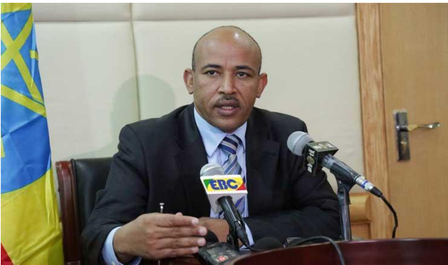
The Minister of Defense Siraj Fegessa speaking at a press conference

The State of Emergency has been amended twice since October, following the restoration of law and order in most areas of the country.