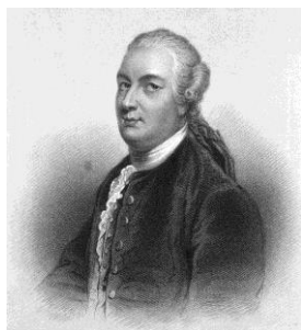
James Bruce, Scottish explorer who traced the origins of the Blue Nile

opportunities to government officials, investors and universities and to the Ethiopian diaspora in Scotland, who were briefed on the role they could play in the overall development activities of the country (see article on page 21).