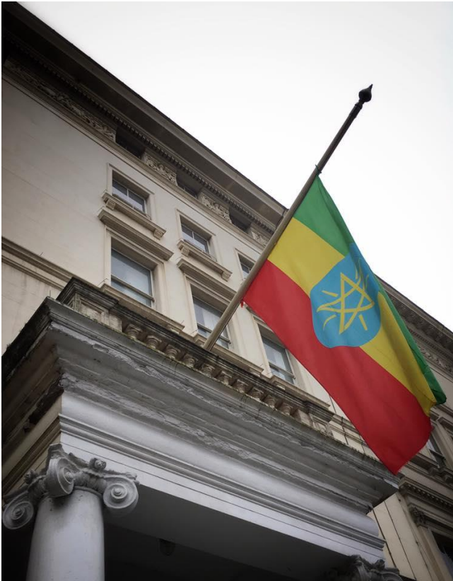
The Flag at the Embassy at half-mast

owned ships and at Ethiopian embassies and consular offices, flew at half-mast.