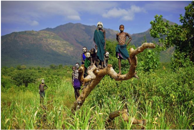
Photo: Children from the Suri tribe pose in Ethiopia's southern Omo Valley region near Kibbish on September 25, 2016