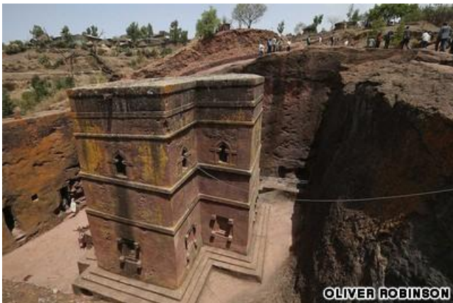
“Lalibela's monolithic churches still impress nine centuries later”

Oliver Robinson lists his top 10 “unexpected attractions” in Ethiopia including fairy tale castles, superb coffee, Martian landscapes and the Ark of the Covenant.