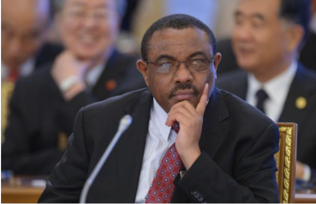
PM Hailemariam at the second working meeting of the G20 heads of state and government, heads of invited states and international organizations

Thirty four world leaders and representatives of international organizations were in attendance at the two-day G20 Summit.