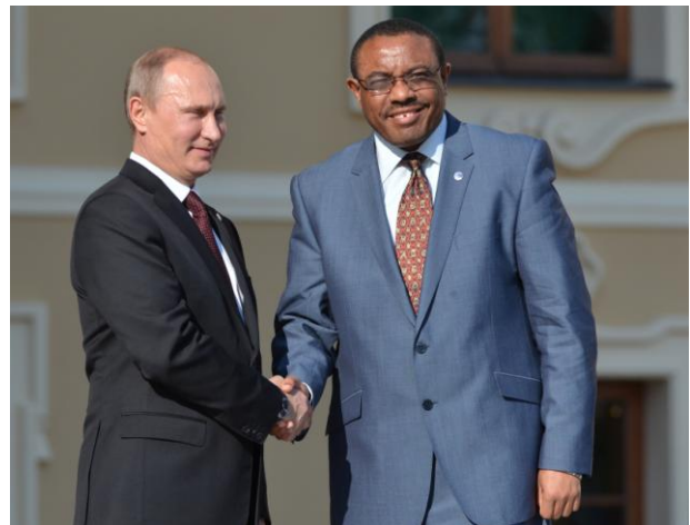
Russian President Vladimir Putin, left, and Prime Minister of Ethiopia, chairman of the African Union Hailemariam Desalegn during the official welcome of heads of delegations.

Prime Minister Hailemariam Desalegn, who attended the Summit as Chairman of the African Union, said the G20 leaders reflected a common stance on investment, job creation and on accelerating development.