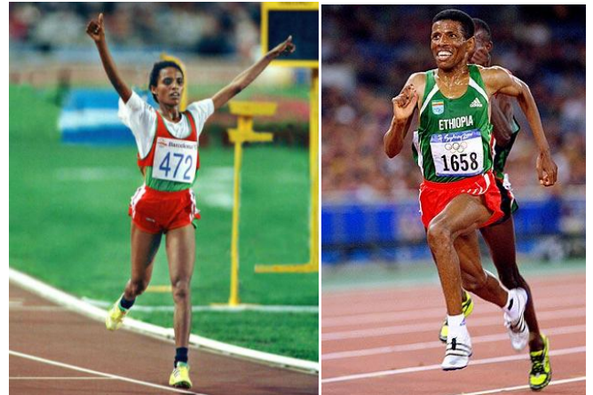
Derartu Tulu (left) and Haile Gebrselassie

Other notables include Kip Keino of Kenya and the 1996 Nigerian Olympic Soccer team in Atlanta. Full list can be found on the following