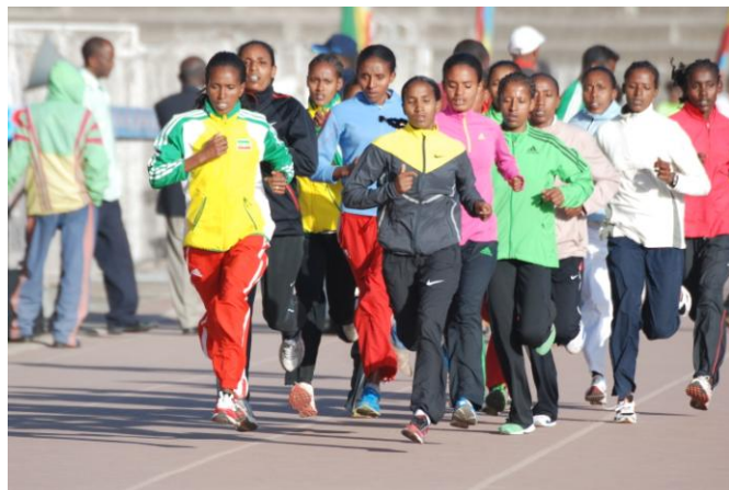
Some of the new Olympic hopefuls in training

The legendary Abebe Bikila was the first black African athlete to win an Olympic gold medal in his marathon victory at the 1960 Olympic Games in Rome. Derartu Tulu at 20, was the first black African woman to win a gold medal in the 10,000m at the 1992 Barcelona Olympic Games. Derartu joins Abebe Bikila, Mamo Wolde, Miruts Yifter, Haile Gebrselassie and Fatuma Roba as the most revered of Ethiopian athletes.