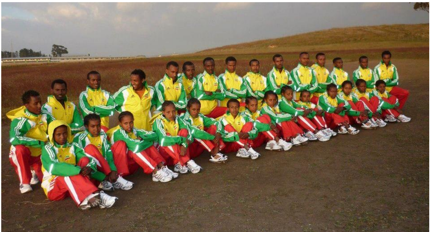
Image: Some of the athletes during training. Team Ethiopia will be represented at the Olympic and Paralympics Games by 39 athletes with a wide range of runners, including new intakes. And for the first time, Ethiopia will be represented in swimming.

The Embassy of Ethiopia in London wishes TEAM ETHIOPIA the best of luck in the upcoming games