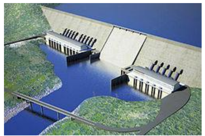
The Grand Renaissance Dam

At its extraordinary session, the Council also agreed to convert the donations made by employees of government and private organizations to bond purchase. So far the amount of employee donations, estimated at three billion Birr, accounts for 4% of the total cost for construction of the dam.