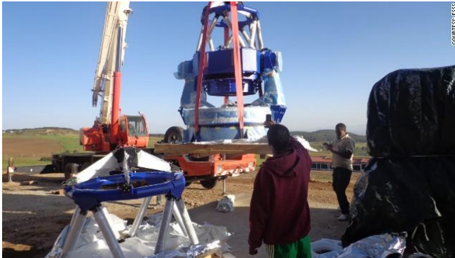
Engineers assemble the telescopes in the Entoto Mountains

“In October, Ethiopia opened East Africa's largest observatory, in the Entoto Mountains on the outskirts of the capital Addis Ababa.