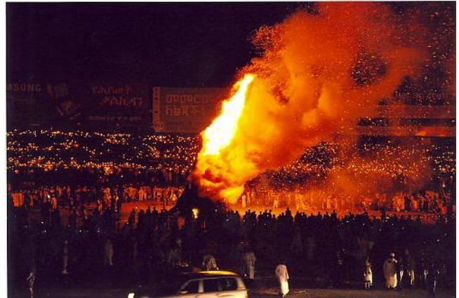
Meskel Celebrations in Meskel Square Addis Ababa

The festival of Meskel is celebrated across Ethiopia on 26 th September to commemorate the finding of the True Cross. Celebrations centre around the burning of the Demera bonfire in Meskel Square in Addis Ababa.