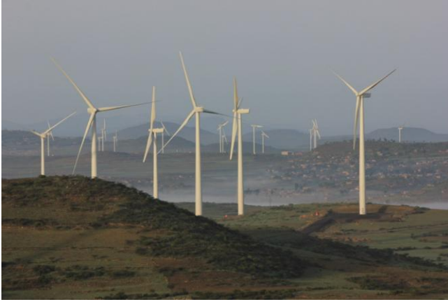
The recently-launched Ashegoda windfarm, with its capacity of 120MW, making it Africa's largest, is the first of several planned wind farms in the country.

"With its multi-billion dollar projects in wind, hydropower, solar and geothermal energy, Ethiopia's pioneering green energy efforts aim to supply power to its 91 million people and boost its economy by exporting power to neighbouring countries."