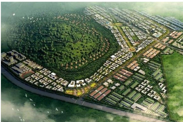
Artist's impression of the Ethiopia-China Light Manufacturing Special Economic Zone. [©China Daily]

Chinese footwear maker, Huajian Group has teamed up with The China-Africa Development Plan and the Ethiopian Ministry of Industry to establish a light-manufacturing base in Ethiopia, making Ethiopia the hub for the global footwear industry and creating more than 100,000 jobs locally in the next 10 years.