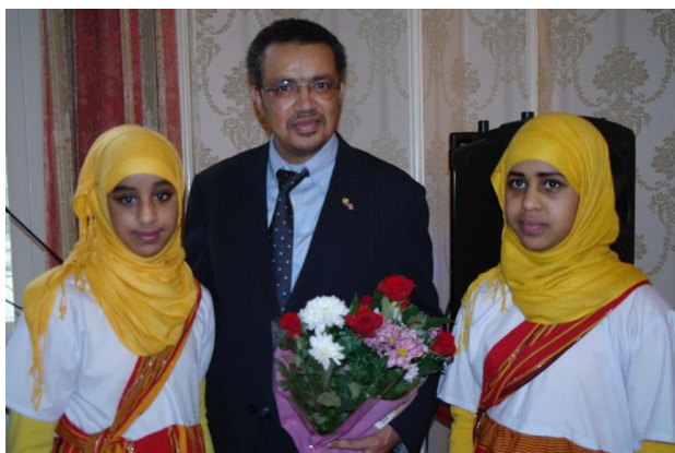
The Minister was presented with a bouquet of flowers from women members of the Ethiopian Somali Diaspora and received a tumultuous welcome at the meeting convened at the Ethiopian Embassy