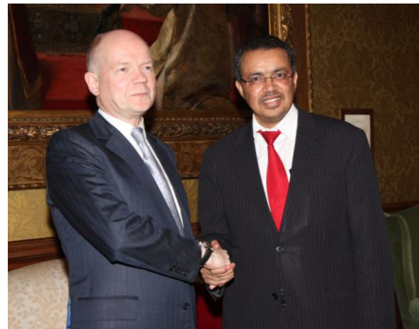
H.E. Dr. Tedros Adhanom with Secretary of State for Foreign Affairs, Rt. Hon. William Hague and below with Rt. Hon. Justine Greening

Secretary of State for International Development (DFID), the Rt. Hon. Justine Greening and UK Africa Minister, the Rt. Hon. Mark Simmonds and other FCO officials.