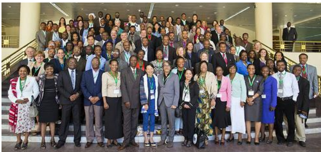
Participants of the conference held at African Union.

From 16 th to 18 th January, Ethiopia hosted the international conference on child survival, under the theme African Leadership for Child Survival: A Promise Renewed .