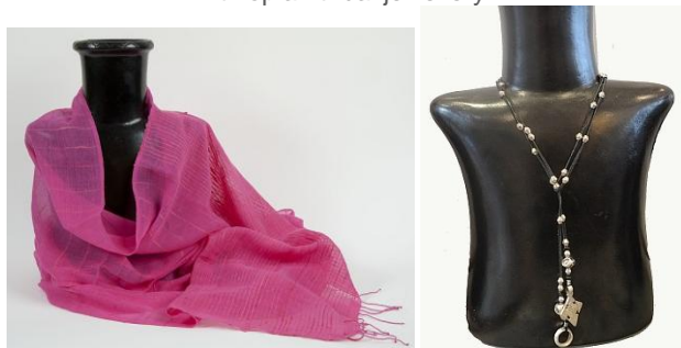
Ethiopian hand-woven sheer silk/cotton shawl and (right) an elegant scarf style necklace made of a mixture of black leather and silver with feature silver piece.