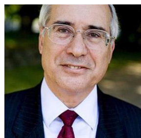
Professor Nicholas Stern (Lord Stern of Brentford) is Chair of the Grantham Research Institute. He was adviser to the UK Government on the Economics of Climate Change and Development from 2005-2007, where he was Head of the Stern Review on the Economics of Climate Change, published in 2006. He was also Chief Economist and Senior Vice President at the World Bank from 2000-2003.

His lessons and legacy on environment and development provide fundamental guidance for Ethiopia, Africa and the world.