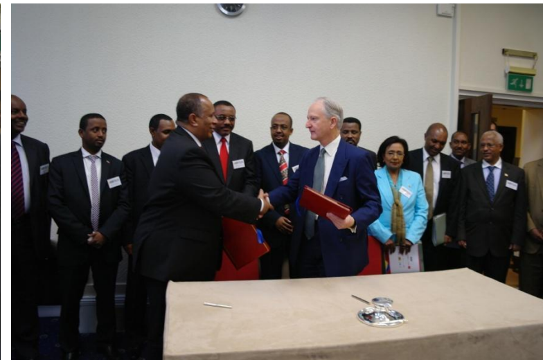
Ethiopia and the UK signed an agreement on avoidance of double taxation before the Forum began. Ambassador Berhanu Kebede and the UK Minister for Africa Henry Bellingham MP signed the accord representing the two sides in the presence of the Deputy Premier and Foreign Minister Hailemariam Desalegn, as well as high level government officials.