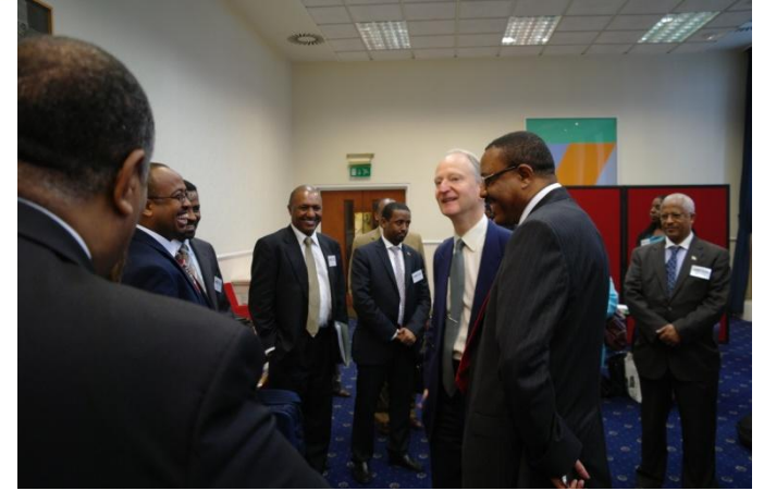
(l-r) H.E. Hailemariam Desalegn, Deputy Prime Minister and Minister for Foreign Affairs, greets guests who included H.E. Henry Bellingham MP, Minister for Africa, Baroness Lynda Chalker, Chairman of Africa Matters Ltd, and Cabinet Ministers from Ethiopia.