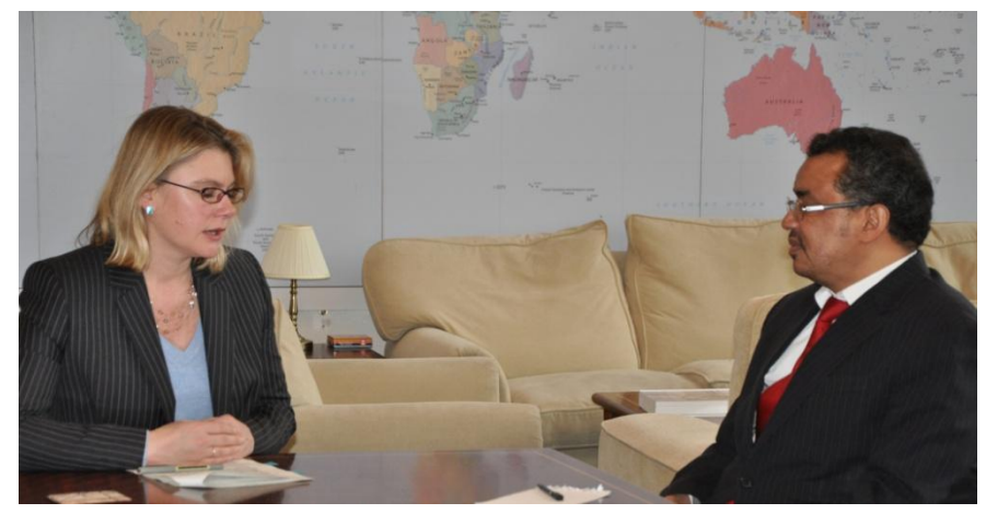
The Foreign Minister with Rt. Hon. Justine Greening