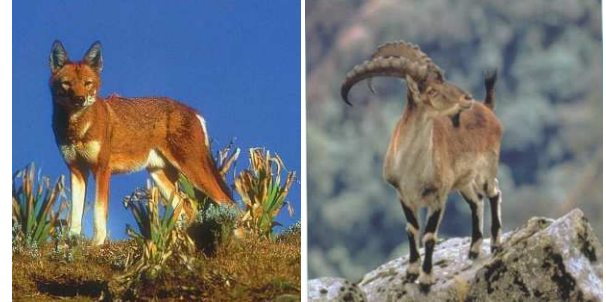
(I-r) The Ethiopian Wolf and the Walia

of their natural habitat due to human activity. A recent census however revealed that the numbers of the endemic walia – a chestnut-coloured wild goat – the Ethiopian wolf and the Gelada baboon at the Simien National Park have increased dramatically.