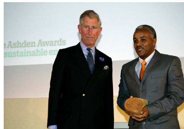
HRH The Prince of Wales with Samson Tsegaye of Solar Energy Foundation, Ethiopia

The SEF scheme has installed over 2,000 small solar systems in two villages that are off the electricity grid, bringing electricity to these communities for the first time. A further 8,500 units are due to be installed elsewhere in the country by the end of the year.