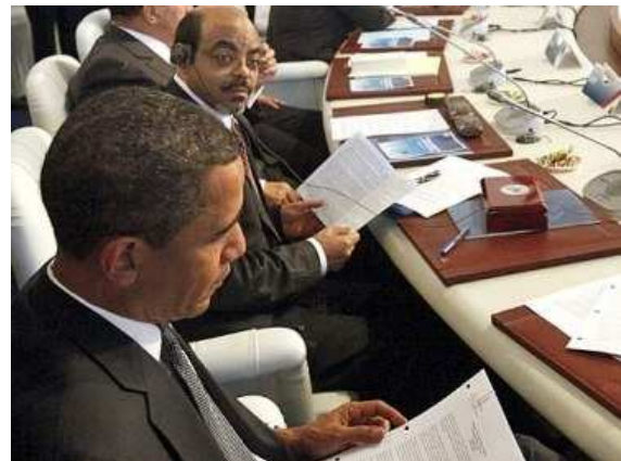
PM Meles with U.S. President Barack Obama during a round table meeting at the G8 summit

Also discussed was the impact of climate change on Africa. Leaders agreed on the need to ensure that the specific concerns of developing countries are adequately addressed in the agreement to be reached at the UN conference in Copenhagen.