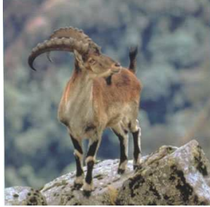
The Ethiopian Wolf and Walia Ibey

Located in Northern Ethiopia, the park is surrounded by many mountains including Ras Dashan, the highest mountain in Ethiopia. The park is home to a number of rare species, including more than 50 species of birds. UNESCO designated the park as a World Heritage Site in 1978.